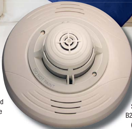
SK-FIRE-CO with B200S Sounder Base (Sold Separately)

The SK-FIRE-CO multi-functional device eliminates the need for a separate CO detector, smoke detector, mini horn, monitor modules, and all of the associated wiring and junction boxes. It also eliminates additional addresses consuming points on the loop. The detector installed inside the sounder base is the only visible device improving the appearance of any room.