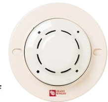
SD505-AIS (Base not included)

An ionization smoke detector that has a sampling chamber and reference chamber for high stability and for a variety of applications where early warning of trouble from super-heated or flaming combustibles is desired. Presence of visible smoke or invisible gases greatly influences the current flow in the sampling chamber, changing the