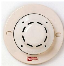
SD505-APS (Base not included)

A photoelectric smoke detector. SD505-APS has an LED light source and silicon photo diode receiving element. The detector features automatic drift compensation for contamination and a simple detector calibration test procedure that can be run at the FACP or remotely using 5650/5651 Silent Knight Software Suite.