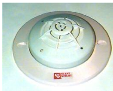
SD505-AHS (Base not included)

A fixed temperature heat detector that uses an externally mounted thermistor with a specially designed cover that protects the thermistor while allowing maximum air flow. SD-505-AHS offers a programmable trip point temperature from 135°F – 150°F (57°C – 65°C). This detector is well suited for environments where smoke detectors cannot be used because of the presence of steam or cooking fumes, such as in a kitchen.