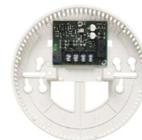
SD505-6IB Isolator Base

A 6" mounting base with a built-in isolator for SD505-APS, SD505-AIS, and SD505-AHS detectors. When the SD505-6IB is connected to the SLC loop, a short, open, or ground fault occurring on the SLC loop is detected as a trouble but all SLC devices continue to operate. SD505-6IB fits under SD505-6AB detector base (included).