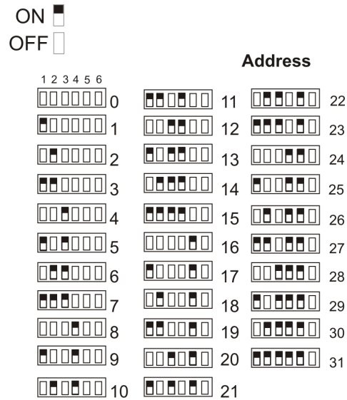
Figure 3: 5824 DIP Switch Settings Used to Set the ID Number

Each 5824 connected to a compatible FACP requires an ID number which is set using the DIP switches on the 5824 circuit board. Refer to Figure 3 to see how to position the DIP switches for the desired ID number. See the FACP installation manual for specific information on device ID assignments.